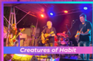
Creatures of Habit